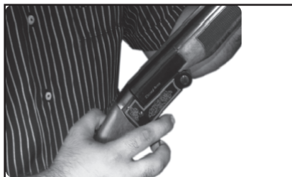
Push the safety button for safety mode. When the shotgun was in this mode, you can not see "red alert" colour on safety button. Important : Please keep the shotgun in safety mode everytime while you are not shooting.