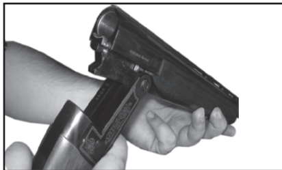
Break your gun gun for loading as shown.