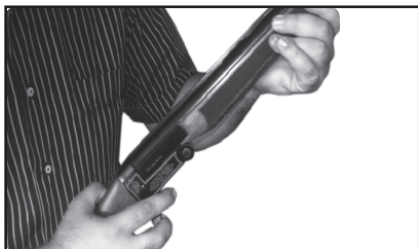
After loading the gun, close the barrel to be ready fire, as shown.