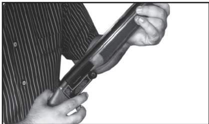
Pull the bolt handle to open the gun, as shown.